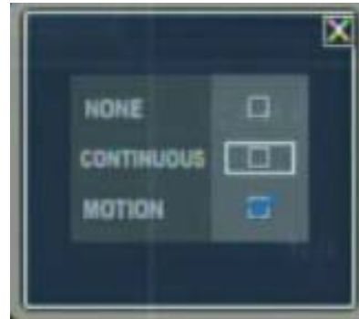
Continuous/ Motion Option Box

Note: Use Enter to check and uncheck items